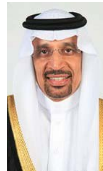
Mr. Khalid A. Al-Falih (Class of '82)

President and Chief Executive Officer, Saudi Aramco (Appointed in 2009)